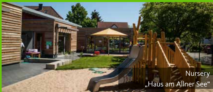
Nursery „Haus am Allner See“