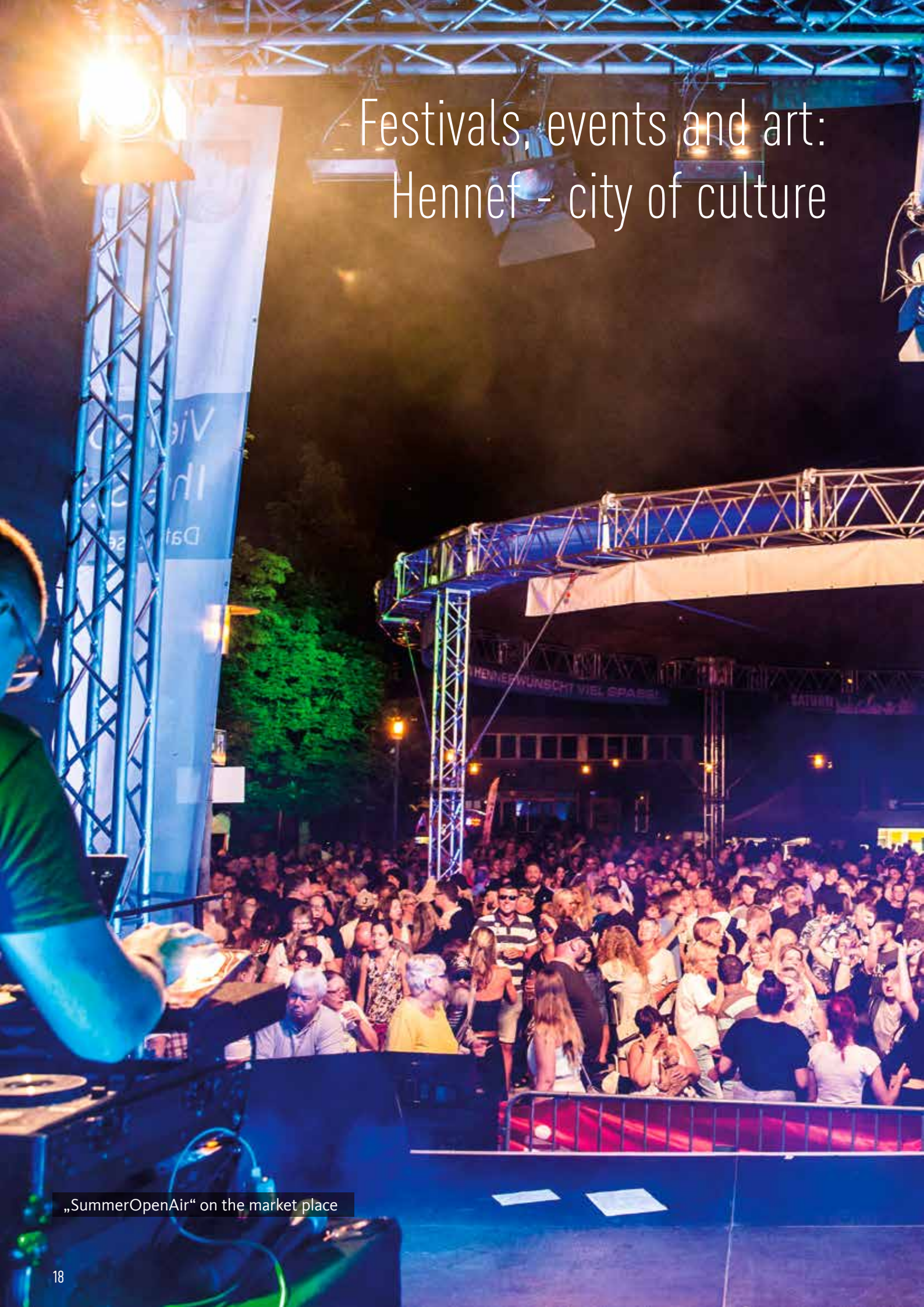
„SummerOpenAir“ on the market place