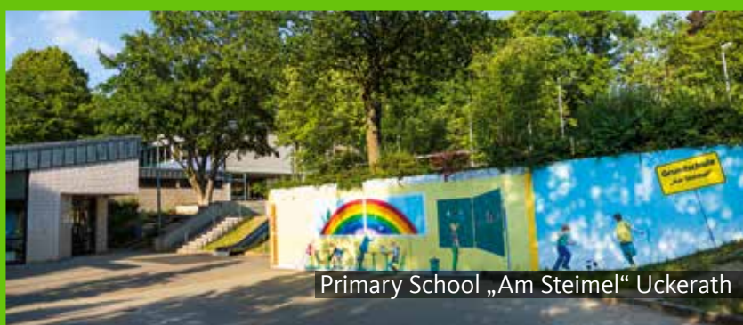
Primary School „Am Steimel“ Uckerath

Mittelrhein Football Association, reads like a who's who of international football, featuring greats such as Sepp Herberger, Franz Beckenbauer, Wolfgang Overath and Lukas Podolski. Following extensive expansion in recent years, Sportschule Hennef remains one of Europe's leading sports academies. Boxers, wrestlers, judoka and weightlifters also train at the academy as it is home to a training centre for martial arts and several federal performance centres.