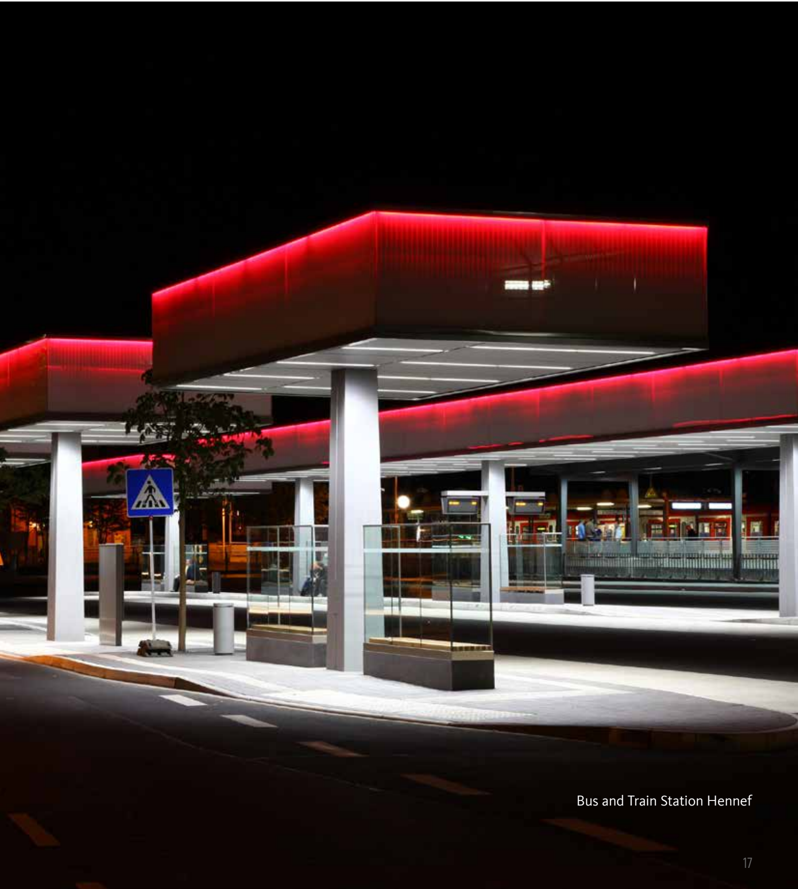
Bus and Train Station Hennef