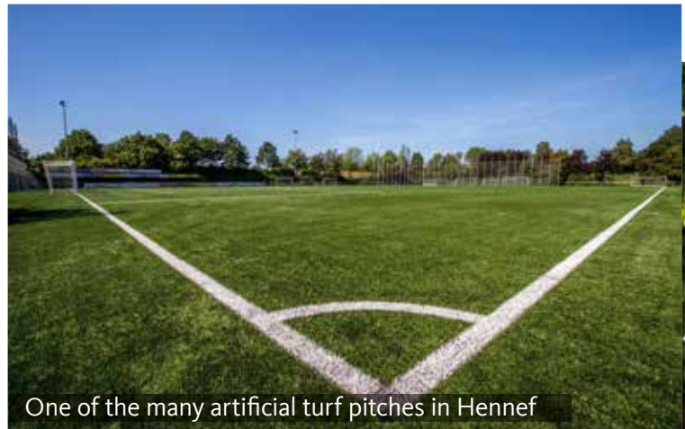
One of the many artificial turf pitches in Hennef

The city implements all sports projects in close collaboration with the StadtSportVerband, the umbrella organisation for sports clubs in Hennef. The organisation has had a major say in planning sports facilities in the town since the Pact for Sport was concluded in 2005. In short, the oft-used phrase „Hennef – City of Sport“ is more than just a slogan. This can be clearly seen in the annual awards for successful athletes, where over 450 sportsmen and women have been honoured in some years. It is also reflected in the children's sport festival, which has been held on the marketplace in Hennef on the first Saturday after the summer holidays since 2005. From morning until evening, over 3,000 children have the chance to try out the activities offered by Hennef's sports clubs from vaulting to tennis.