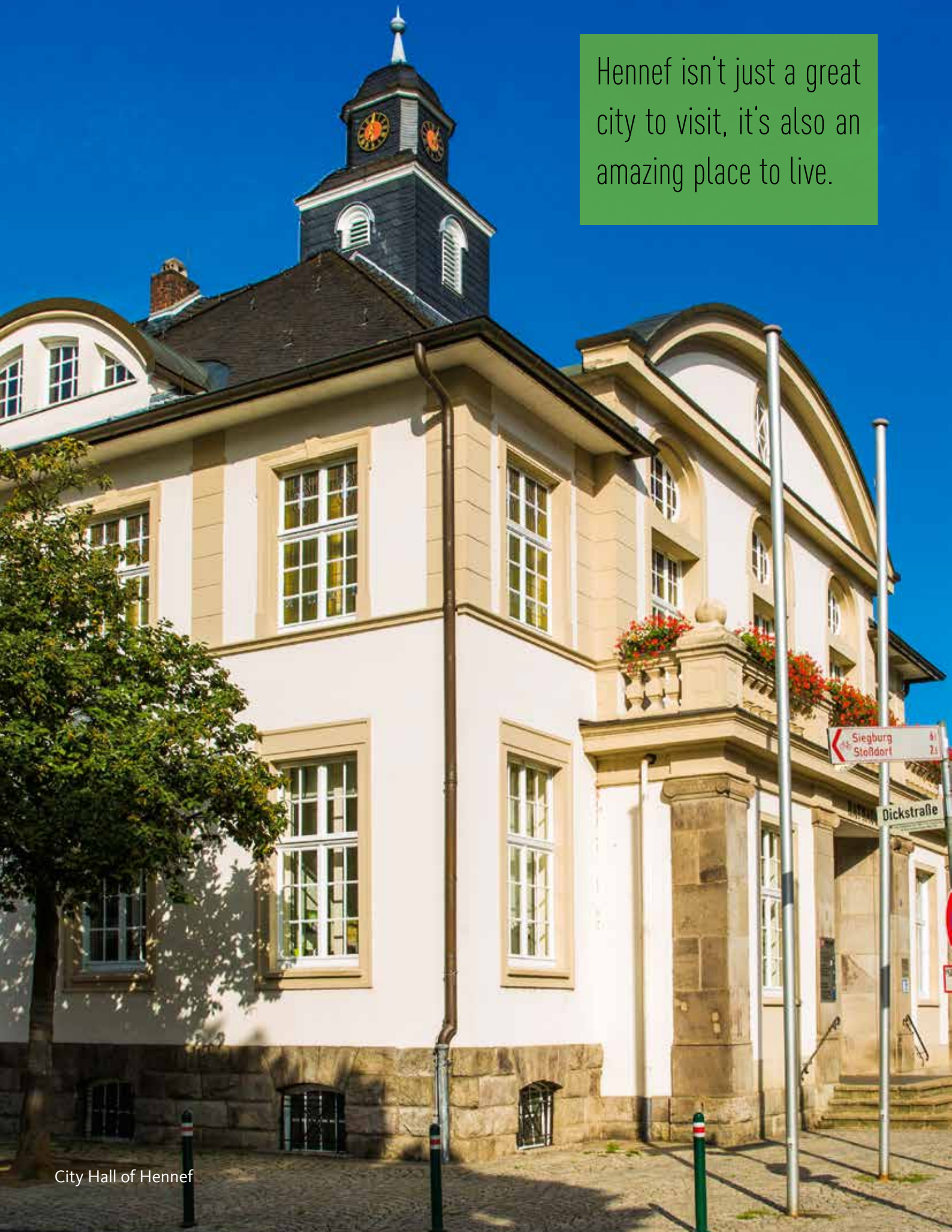
City Hall of Hennef

Hennef isn't just a great city to visit, it's also an amazing place to live.