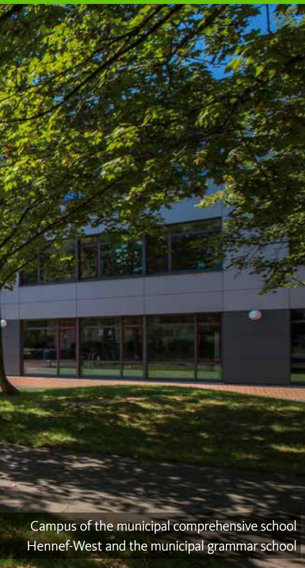
Campus of the municipal comprehensive school Hennef-West and the municipal grammar school

The city is served by eight primary schools, all of which offer all-day schooling. There are also two municipal comprehensive schools (Gesamtschule), one private comprehensive school specialising in art, and a municipal grammar school (Gymnasium).