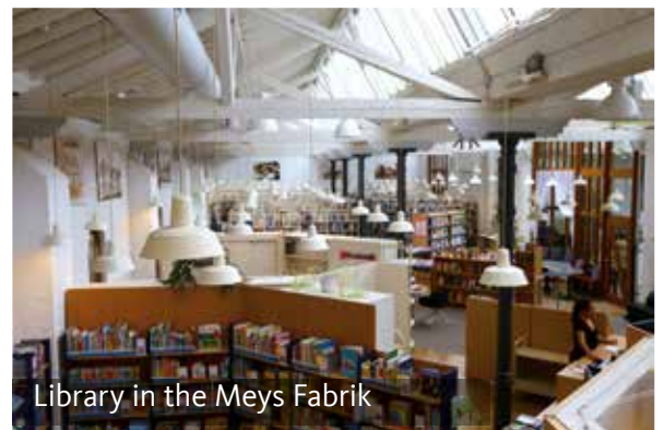
Library in the Meys Fabrik

The city's music school has trained many hundreds of students since it was founded over 65 years ago. Some have even used their training here