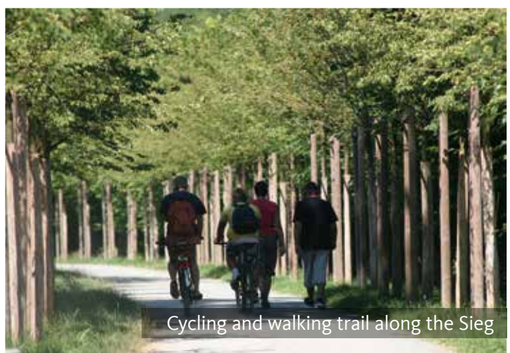
Cycling and walking trail along the Sieg