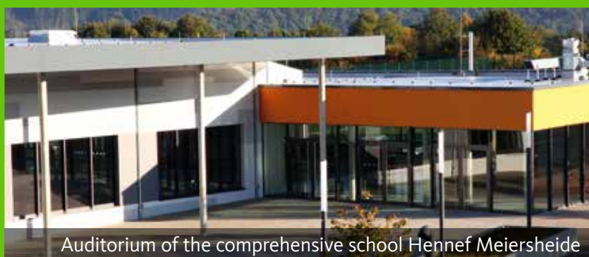
Auditorium of the comprehensive school Hennef Meiersheide