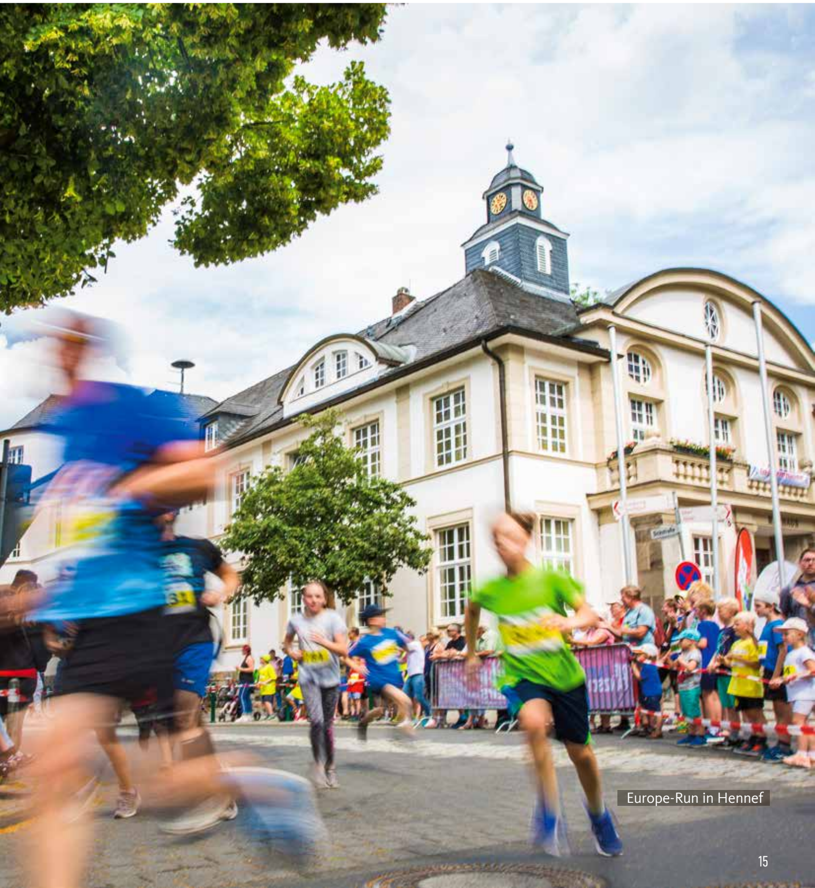
Europe-Run in Hennef